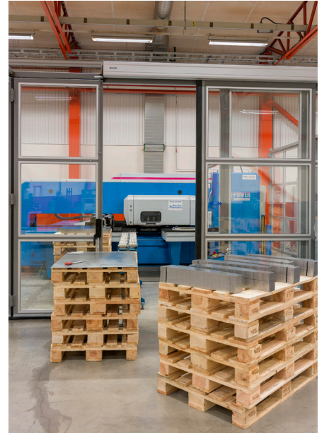
Fully glazed machine protection door with machine operation.